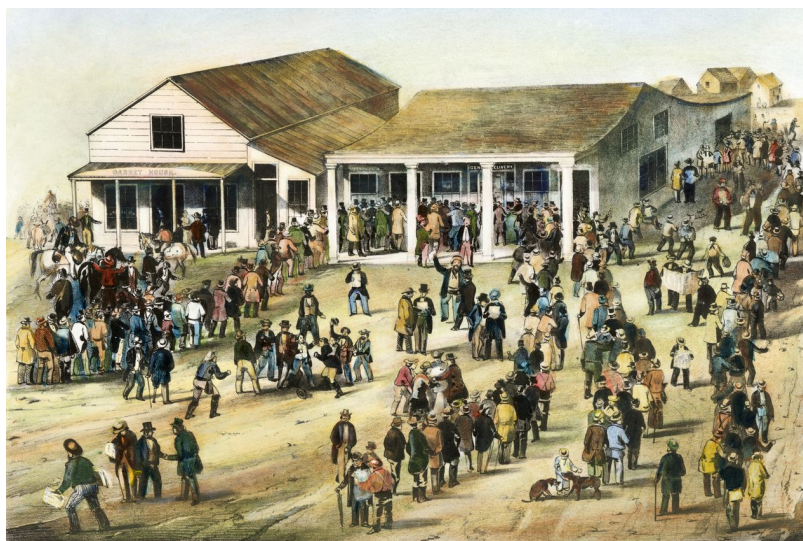
A San Francisco post office in 1849.

If rumors of riches triggered a stampede to a mining camp, the Post Office Department was expected to serve the location right away.